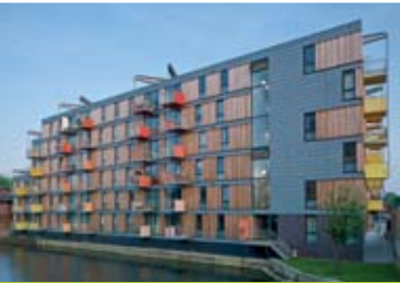
■■■ Adelaide Wharf, London. Winner, Housing Design Awards 2008. Architect - Allford Hall Monaghan Morris