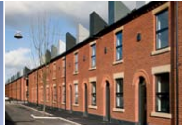
■■■ Chimney Pot Park, Manchester. RIBA Northwest Award 2008 and shortlisted for RIBA Stirling Prize, in association with The Architects' Journal. Architects - Shed KM with Urban Splash

The RIBA wants to see a revolution in attitudes towards architecture in the UK. We want to see policymakers and politicians not just accept that good design is vital but actively promote it.