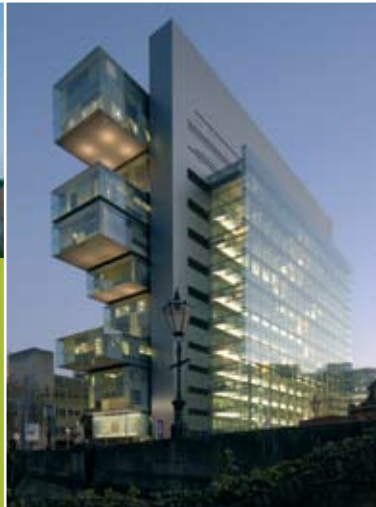
■■■ Manchester Civil Justice Centre. RIBA National Awards 2008 and shortlisted for RIBA Stirling Prize, in association with The Architects' Journal. Architects - Denton Corker Marshall.