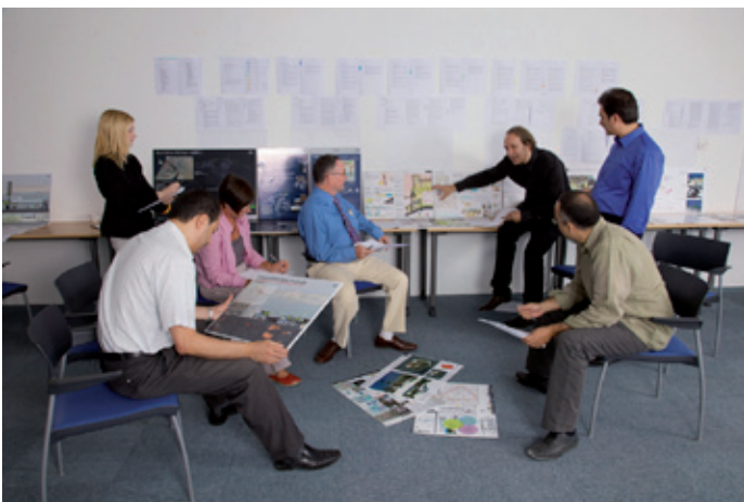
Photos from judging session