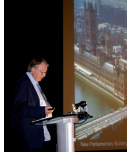
Sir Michael Hopkins