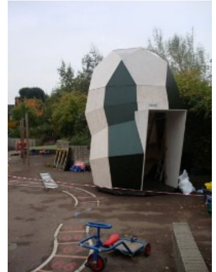
Amenity Space Pod at Weston Park Primary School