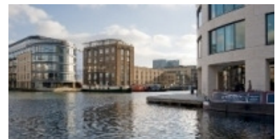
Regents Canal- British Waterways