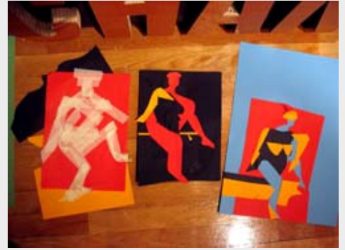
The Social- with London drawing