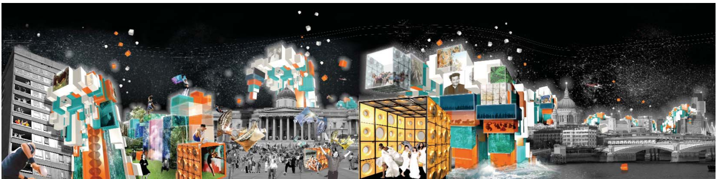
Artaud's tabernacle by Amenity Space