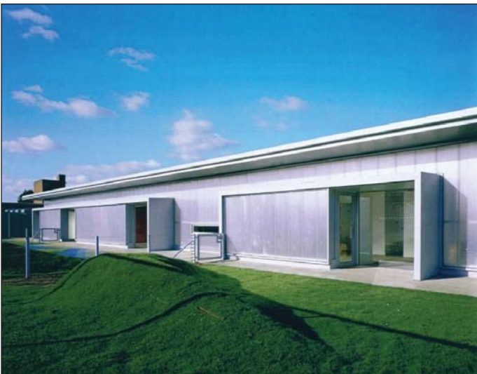
John Perry Children's Centre , Dagenham (DSDHA)