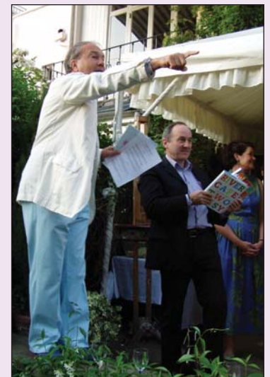
The auctioneer in action