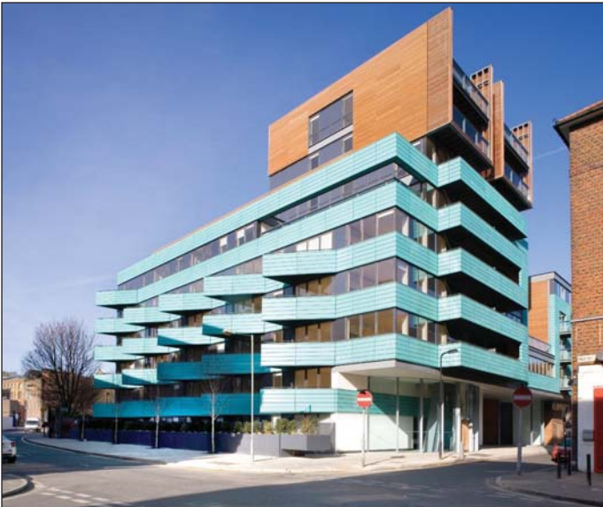
Nile Street N1 (Munkenbeck & Marshall Urbanism Limited)