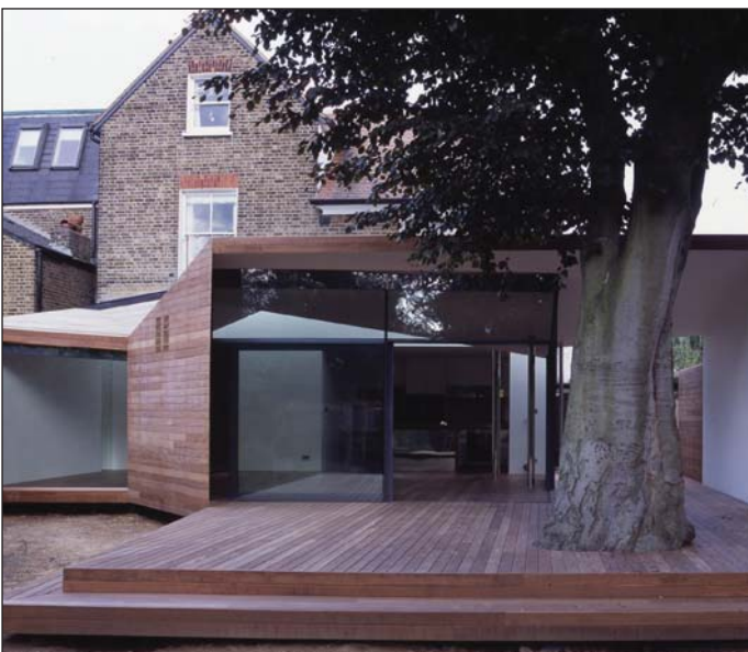
Wrap House W4 (Alison Brooks Architects)