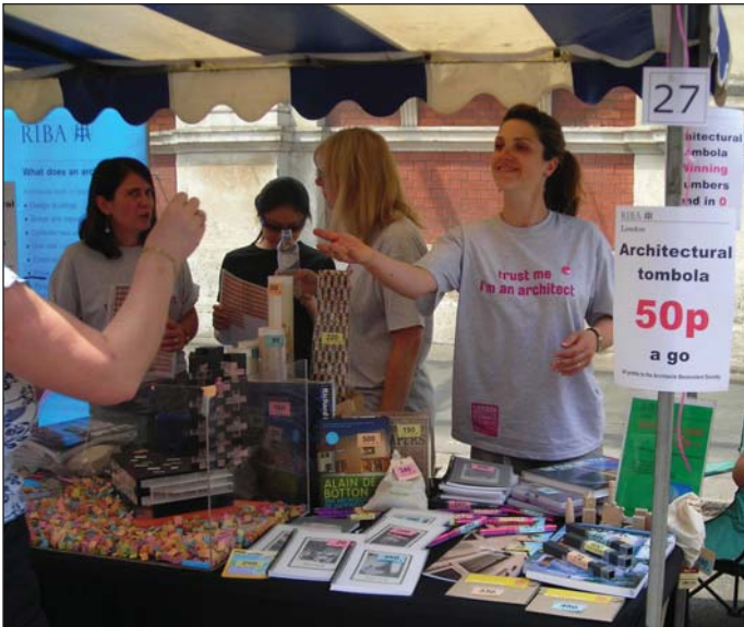
RIBA stall busy raising money for the ABS