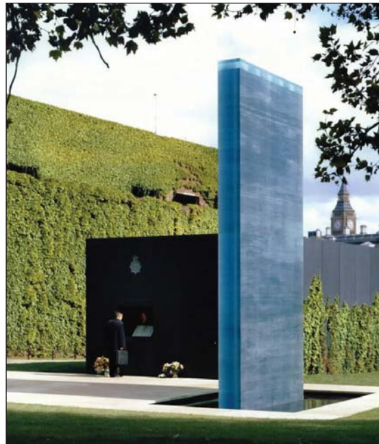
National Police Memorial SW1 (Foster and Partners)