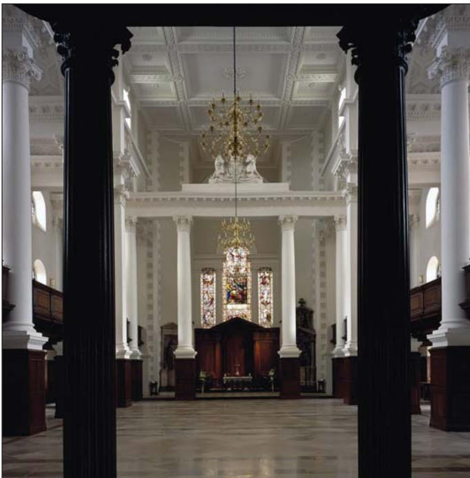
Christ Church Spitalfields E1 (Purcell Miller Tritton)