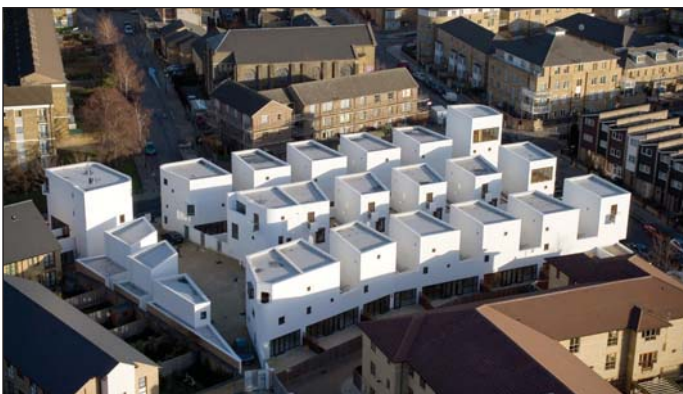
Donnybrook Quarter E3 (Peter Barber Architects)