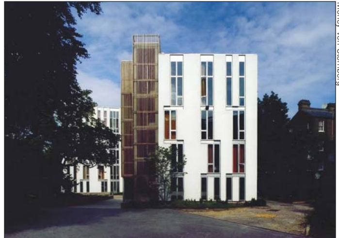
Newington Green Student Housing N16 (Haworth Tompkins)