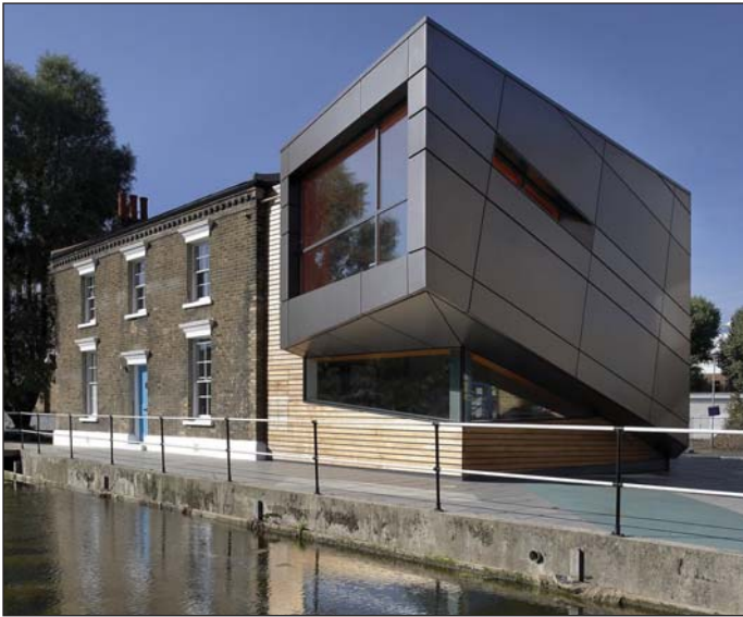
Lock-keeper's Graduate Centre E1 (Surface Architects)