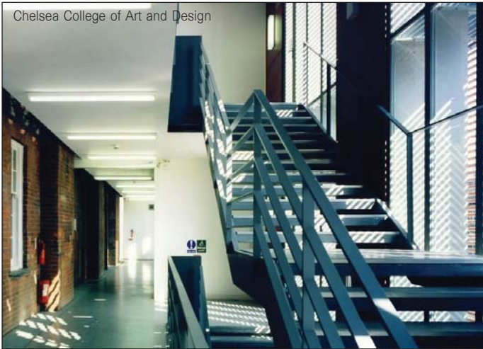
Chelsea College of Art and Design , University of the Arts SW1 by Allies and Morrison