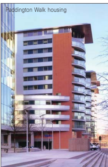
Paddington Walk housing W2 by Munkenbeck & Marshall

New classrooms at Halffield School W2 by Caruso St John Architects