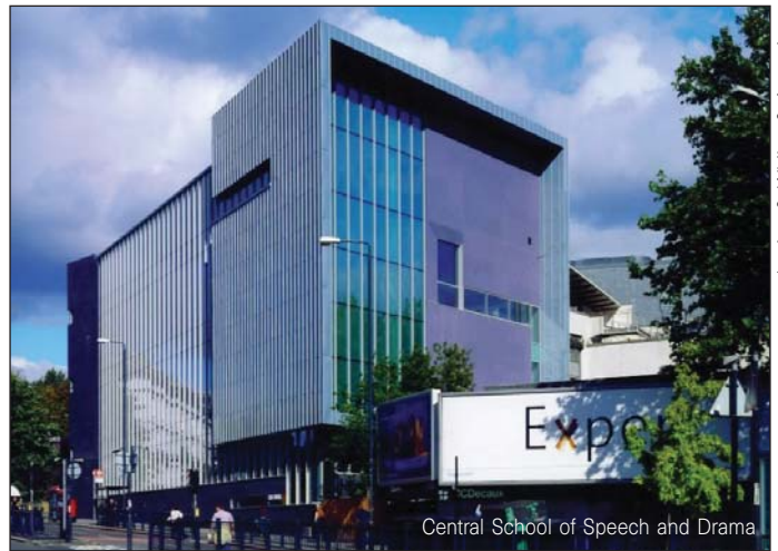
Central School of Speech and Drama

Parliament Hill School NW5 by Haverstock Associates