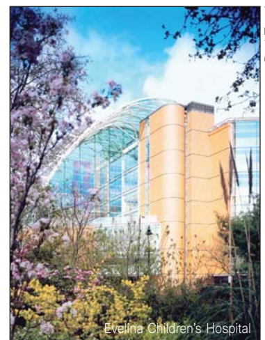
Evelina Children's Hospital

15/25 Davies Street W1K by Kohn Pedersen Fox Associates (International) PA