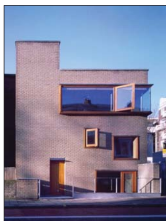
Private House in N1

Thomas Fairchild Community School N1 by Haverstock Associates