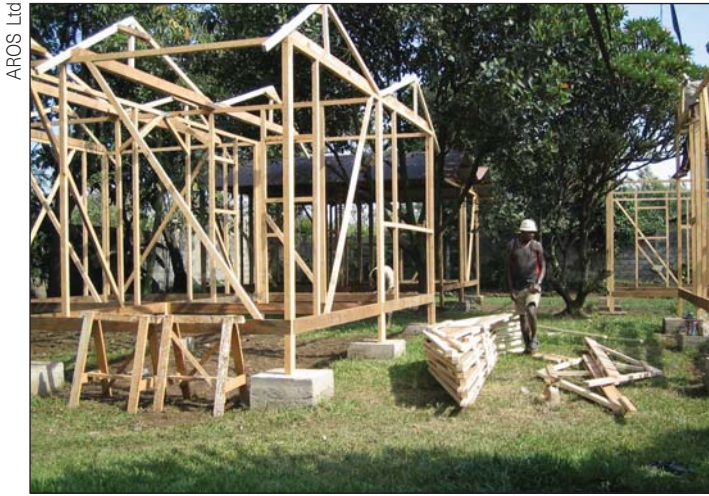
AROS Ltd - Flatpack Shelter Housing

The full list of exhibitors in the Sustainable Living by Design exhibition is: