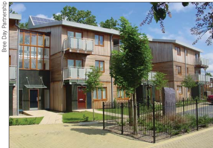
Bree Day Partnership - Alpine Close