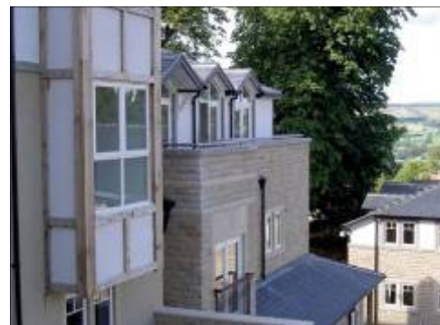
Completed scheme for Raven Audley Court, Ilkley, West Yorkshire (100,000 sq ft scheme of 98 apartments)