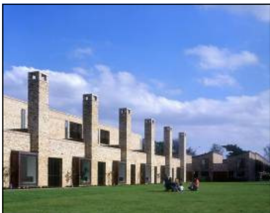
RIBA-Award-winning scheme, Accordia

How can good architecture capture our imagination, and change the way we relate to our neighbours? How can architects revitalize neglected areas and improve our health and well-being? Good spatial design can provide a more attractive environment, stronger communities with a sense of pride and ownership as well as attracting financial investment. To sustain a vibrant community, well-designed buildings and public space are vital. In many ways the qualities needed for well-designed buildings and landscapes can mirror those needed to maintain a cohesive society: innovation, forward-thinking and creativity.