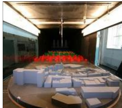
Inside the Wind Tunnel

Natural ventilation is driven by a variation in air pressure over the building envelope, which is often dictated by the form of the building itself as well as its surroundings. The wind tunnel simulates these conditions and allows measurements to be made of the relative pressures upon different façade components. These measurements could be used to check ventilation rates, air movement and ventilation strategy through numerical simulation. The modification of ground level wind by buildings can also be simulated. Areas of potential wind discomfort can be identified and corrective measures can be tested.