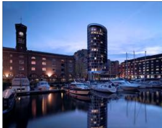
Proposal for a development framework across the St Katherine's Dock estate, London