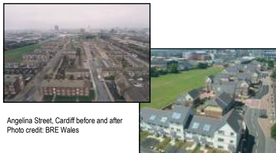
Angelina Street, Cardiff before and after

One size certainly doesn't fit all, and George Clarke, presenter of Channel 4's The Home Show , is certainly no 'off the shelf' architect. He will give the Inspiration Hour talk at the end of the conference to send delegates away inspired and positive.