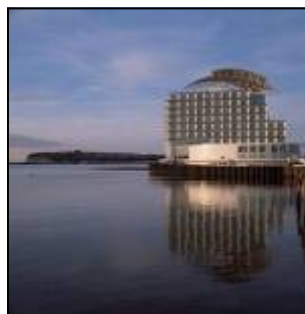
St David's Hotel, Cardiff Bay