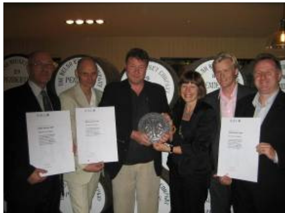
The award-winning team at Penderyn Distillery (above)