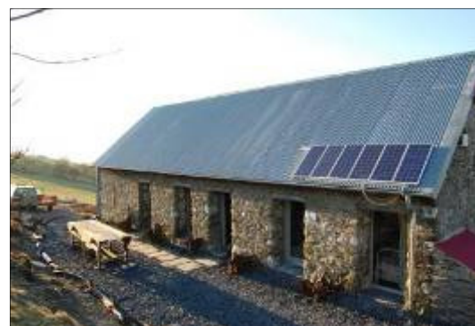
Bedyd Banc - Ysgubor heb gysylltiad at grid cenedlaethol mewn man goidlog uwchben Dyffryn Dyfi. Mae'r cyfrifon cyntaf yn dangos bod y sguor yn cyrraedd at targed ddi-garbon gan ei fod yn cynrychi mwy o egni na mae'n defnyddio