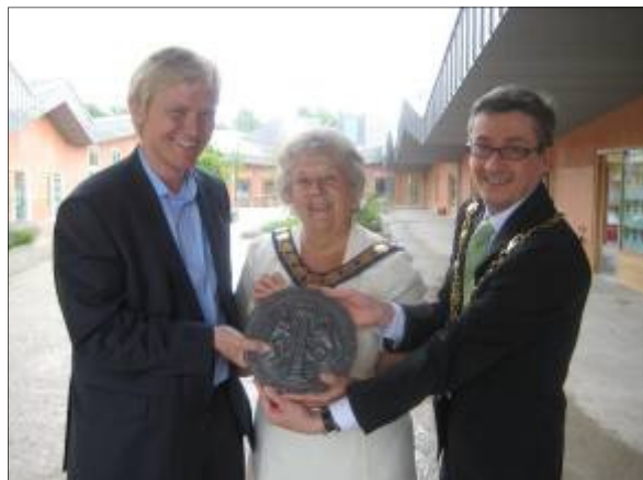
The delighted clients for Ruthin Craft Centre (above)