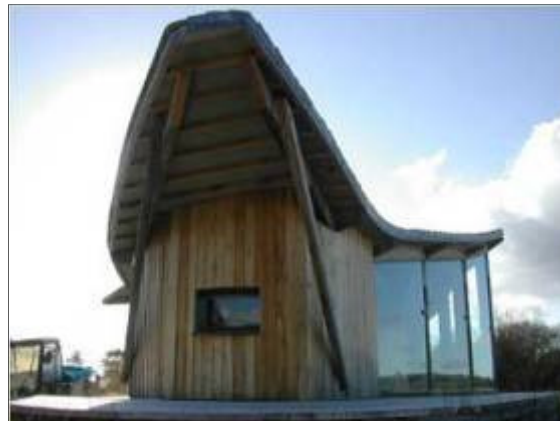
Cyfleusterau Addysg ac Ymwelwyr yn Gors Caron, Tregaron

This article is available in English upon request.