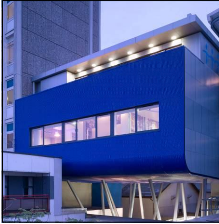
Skypad, the Teenage Cancer Trust Unit by Orms Architecture Design/ Stride Treglown Davies, won the public vote in the Western Mail, securing just under 20% of the vote

Support for the RIBA Awards in Wales this year has been fantastic: an online poll in the Western Mail caught the eye of over 900 people who voted for their favourite building in the shortlist.