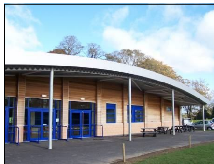
Queen Elizabeth High School, Carmarthenshire

When the right decision is to incorporate the existing building, their knowledge of the character and construction of the original leads to equally successful projects such as the creation of a £3.5m Conference Centre in Church House, a Grade II listed building in Westminster.