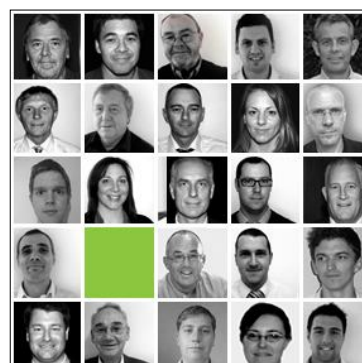
Team players at Lawray

For more information on Lawray Architects visit: www.lawray.co.uk , or contact: T 02920 762511, e info@lawray.co.uk