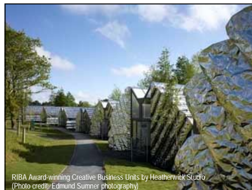
RIBA Award-winning Creative Business Units by Heatherwick Studio