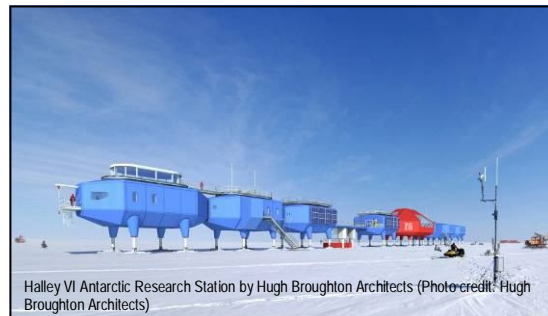
Halley VI Antarctic Research Station by Hugh Broughton Architects