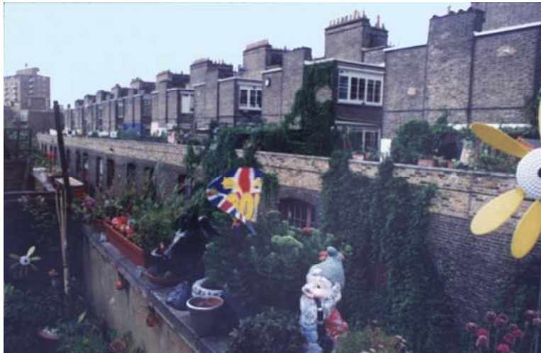
Illustration 3: Victorian terrace with rooftop gardens

This brings us to Donnybrook, which was shortlisted last year for the Stirling Prize and has had a lot of publicity (illustration 4).