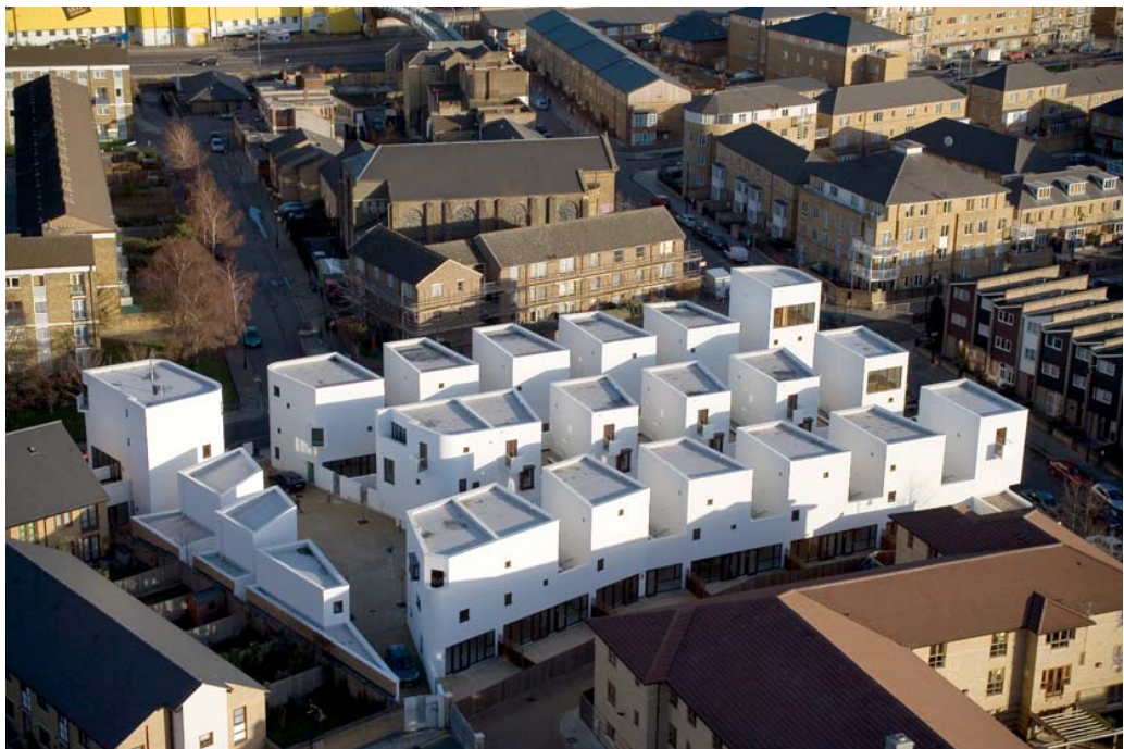
Illustration 4: Donnybrook Quarter from the air

This brings us to Donnybrook, which was shortlisted last year for the Stirling Prize and has had a lot of publicity (illustration 4).