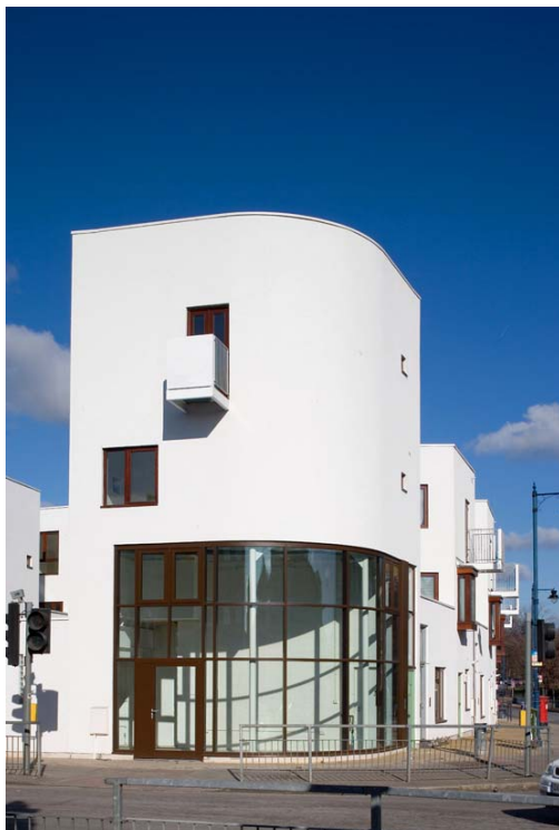
Illustration 5: the buildings of the quarter respond to and shape the streetscape

It is picturesque in a way, in that it celebrates particular corners (illustration 5) and particular views and explores the boundary between public and private space. Balconies overhang the streets, bay windows create strong visual connections with the street and also act like little display cabinets. When you go back there are flower arrangements in windows, teddies, and things like that. It all comes back to the Walter Benjamin idea.