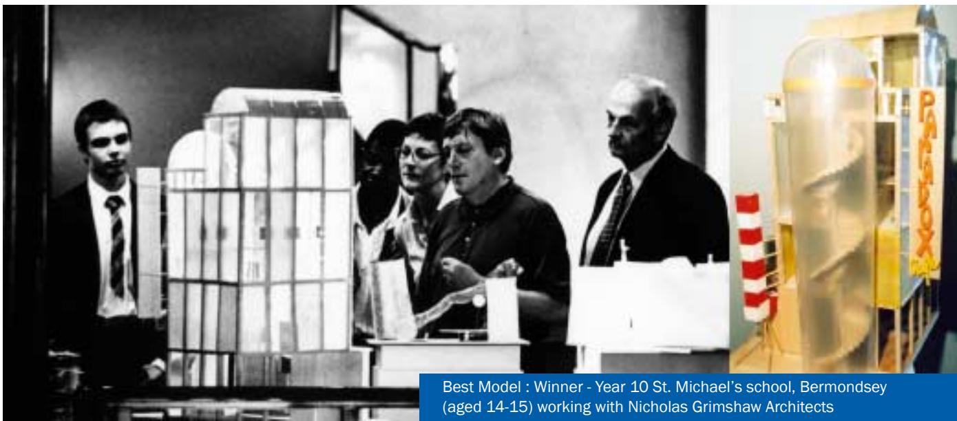
Best Model : Winner - Year 10 St. Michael's school, Bermondsey (aged 14-15) working with Nicholas Grimshaw Architects

Our proposals emerged from the students' interests and needs: a milkbar, a swimming pool, music and games rooms etc. Mid-way through the project we took a break to visit Nicholas Grimshaw's design studios to experience the atmosphere and activities of a busy design firm. Following this we took a trip to Paddington Station to look at the practice's recently completed additions to the Victorian railway terminal. At Paddington we discussed materials, detailing, and the challenge of creating new architecture in historic environments. With this introduction to the profession of architecture and design in London - the group returned to the Art room at St. Michael's and 'got busy' with wood, glue and pencils creating a collection of spicy urban proposals, some of which are shown here.