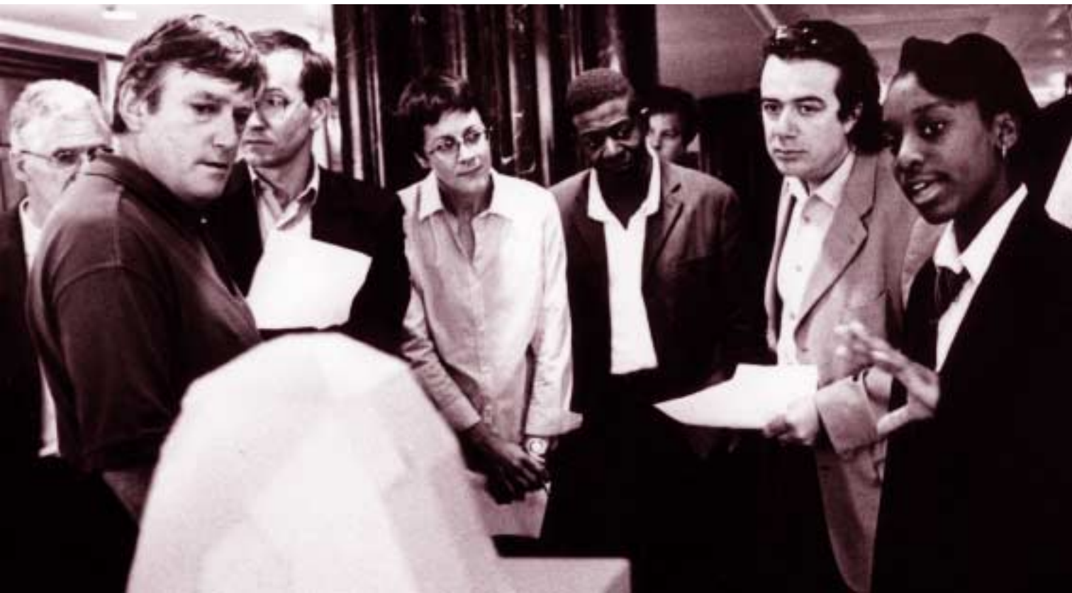
Best 2D Work - St. Angela's Ursuline / Wilkinson Eyre Architects