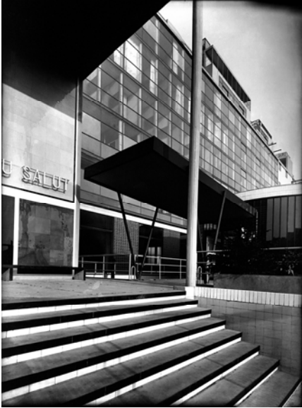
Cité de refuge, Paris,1929-33 © FLC/ADAGP, Paris and DACS, London 2008.

of interlinked spaces and geometric shapes make it clear that it is a 'man made' design statement in contrast with nature. The visual contrast is given even greater impact by the building being painted white and raised off the ground on slender stilts.