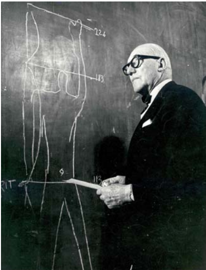
Portrait of Le Corbusier, © FLC/ADAGP, Paris and DACS, London 2008.