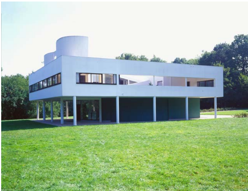
Villa Savoye, Poissy, 1928-31

When he set up his own studio in 1918 he started to publicise his ideas on architecture and 'the machine age' on which his design philosophy was based. For him a house was to be thought of as a machine to meet the needs of living. Public perception of the buildings based on this design approach was negative and they deemed the buildings as being ugly. However, there were wealthy clients who thought such buildings were a novelty and so many of them commissioned Le Corbusier to design the houses that were in the forefront of fashion. It was these buildings that established him on the world stage but after a number of years he became disillusioned with his buildings being fashion icons and turned to the design of buildings to meet the expanding needs of society.