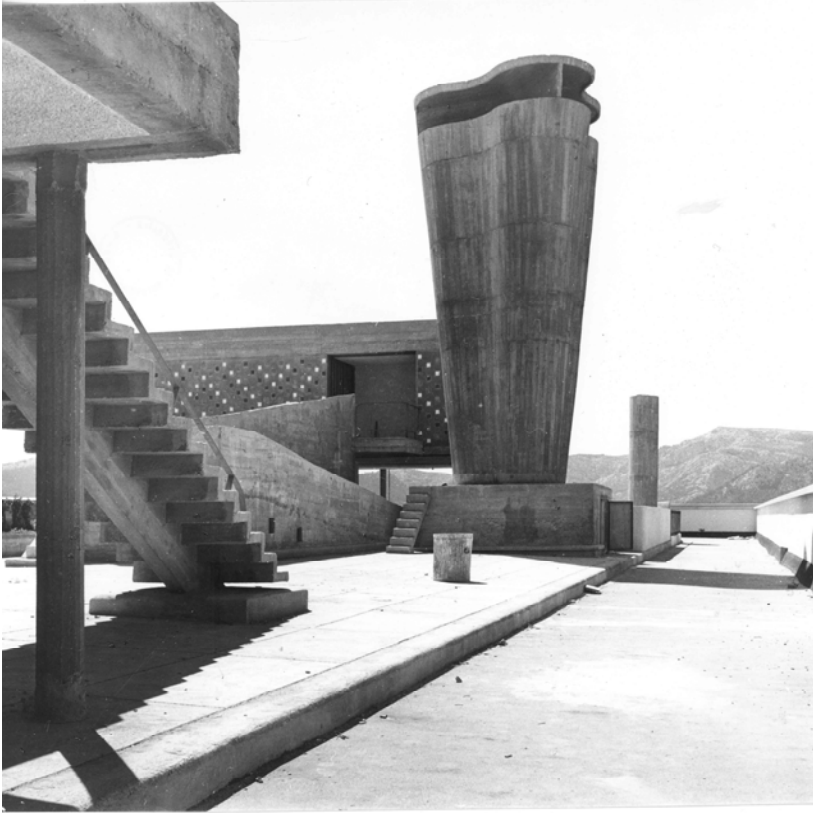
Unité d'habitation de Marseille, roof view, 1946-52 © FLC/ADAGP, Paris and DACS, London 2008.