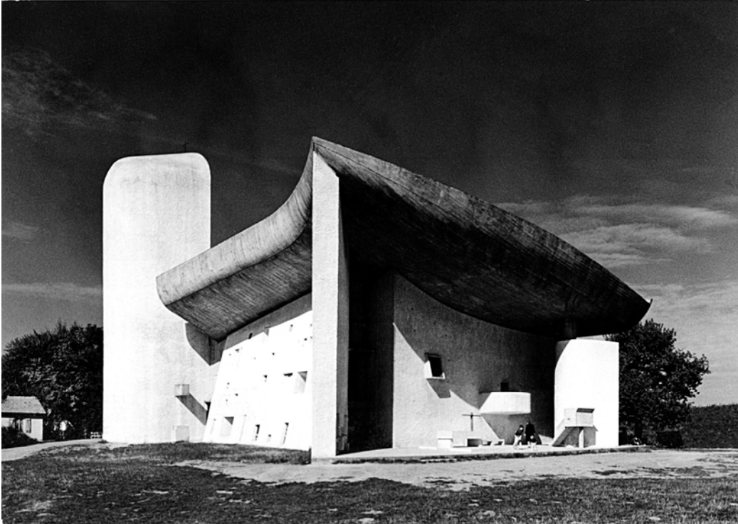
Notre Dame du Haut chapel, Ronchamp, 1950-55 © FLC/ADAGP, Paris and DACS, London 2008.