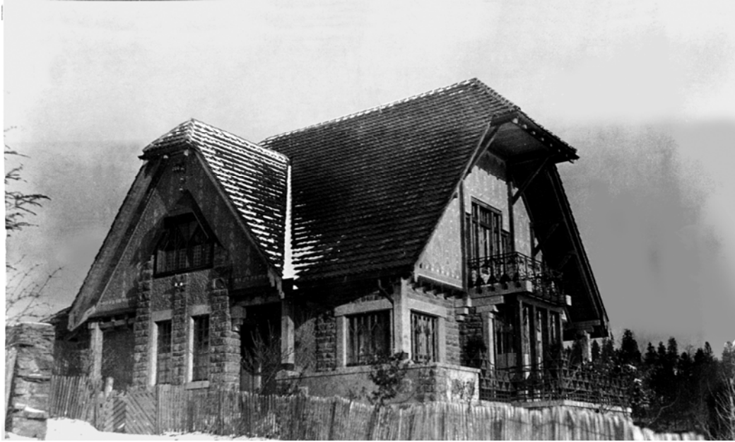
Maison Fallet/ © FLC/ADAGP, Paris and DACS, London 2008.

Maison Fallet – A family home built on a hillside. The detail and ornament of the house is based on geometric patterns and the simplification of natural forms, like seeds and leaves. The design philosophy of this house is an extension of nature and in harmony with its site, a position that was the core of the Arts and Crafts Movement.