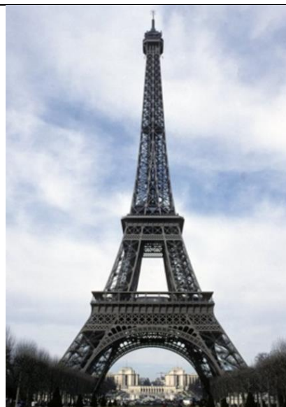
Eiffel Tower, Paris, 1990.