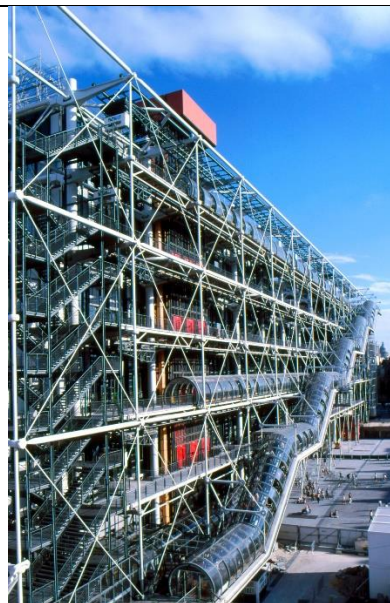
Pompidou Centre (Centre National d'Art and de Culture Georges-Pompidou), Paris, 1996.