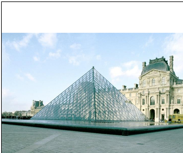
Louvre, Paris: the Pyramid, 1993. Designed by I. M. Pei & Partners

Why not explore our RIBApix Collections to see what buildings you could try and recreate using sticks? We've put some of our favourites below to get you started!