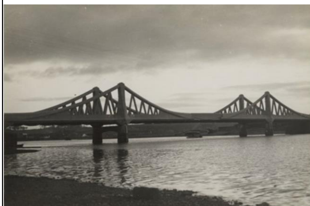
Old Montrose Bridge, Angus, 1931. Designed by Sir Evan Owen Williams

Source: Emmanuel Thirad, RIBA Collections