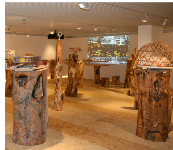
Forest of Fabrication