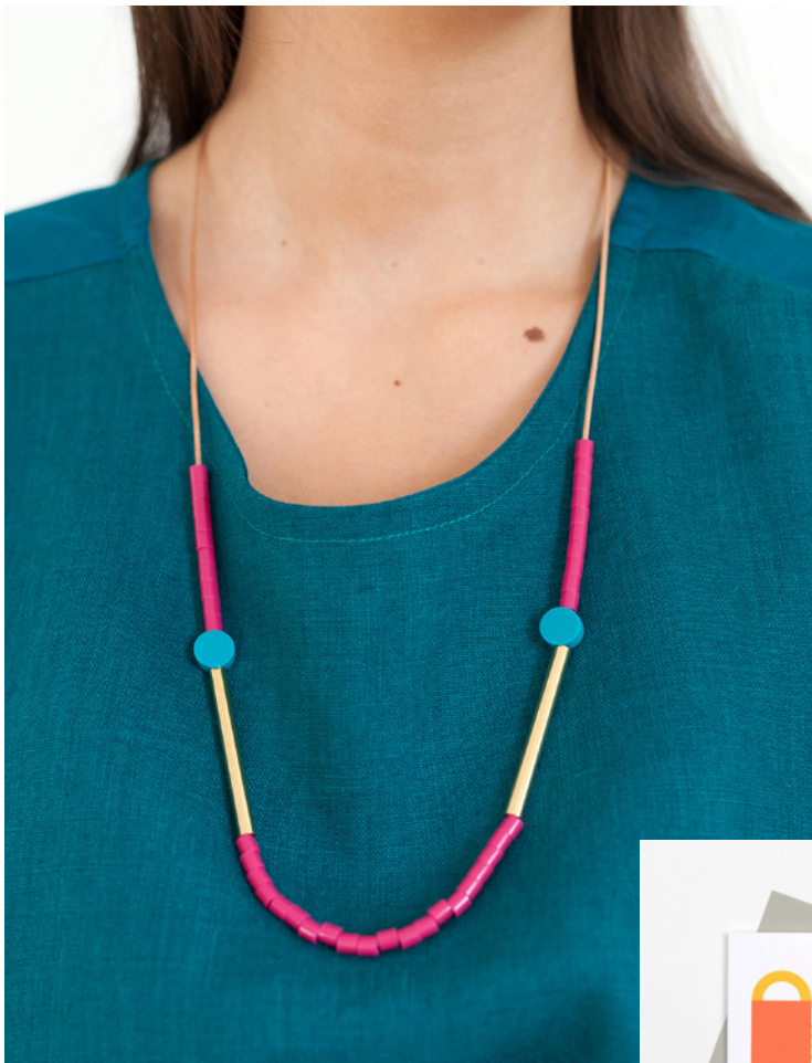
Jewellery by Loela

Here at RIBA North our shop features a range of exclusive RIBA merchandise alongside books, gifts and stationery for architecture and design enthusiasts. Throughout the year we play host to a changing variety of talented designers and brands; presenting architecturally inspired products by Areaware, Tom Pigeon and Cinquopoints. We also stock a range of publications including the The Modernist, C20 Magazine and Apartamento.