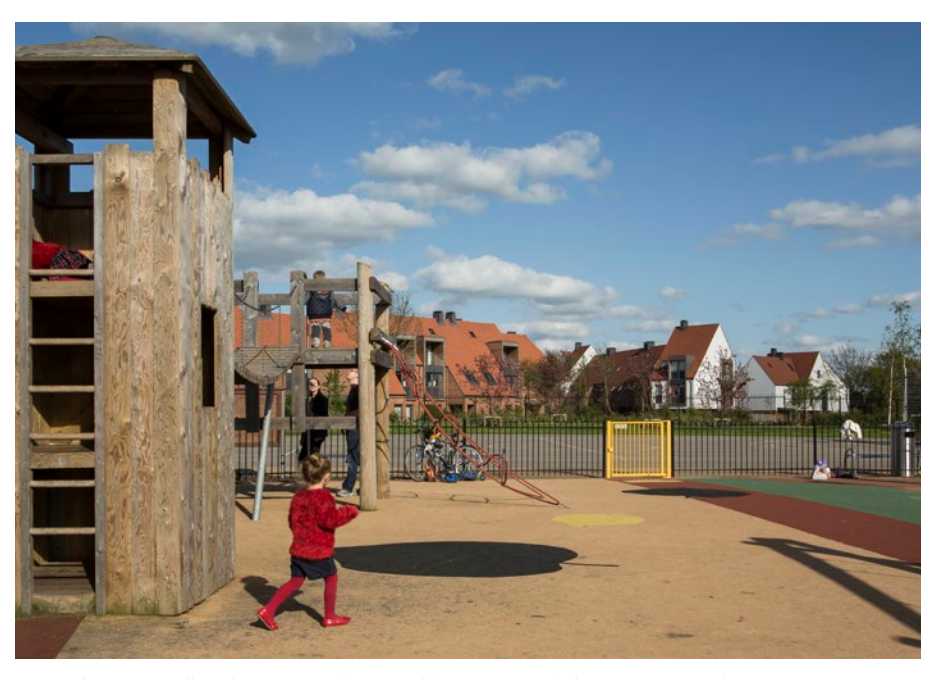
Derwenthorpe "A socially and environmentally sustainable community including energy efficient homes, incentives for lifestyle change, the promotion of community participation and long-term custodianship."