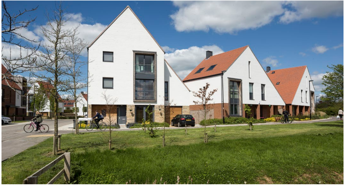
Derwenthorpe A network of pedestrian and cycle routes cross the site allowing easy access between neighbourhoods and into the centre of York.