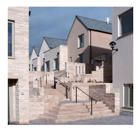
Officers Field "Simple pitched roof forms and self-colour render walls, set against Portland stone, offer a richness and layering to the ensemble."

The scale, form and design of buildings clearly define public, communal and private spaces, and the settlement boundaries, helping people to understand the place and find their way around. Civic spaces where people meet, such as public squares or greens, are framed by larger, more prominent buildings, while residential streets have a more intimate scale, reflecting the pattern of day-to-day life. The new housing creates a sense of enclosure and a safe haven within the wider neighbourhood, nurturing social interaction in shared spaces which afford shelter, shade and sun where needed. These 'outdoor rooms' are flanked with a variety of familiar, tried-and-trusted or innovative housing types, creating an authentic neighbourhood mix to attract different kinds of resident. The external appearance of homes is consistent in its appeal and not distinguishable by tenure.