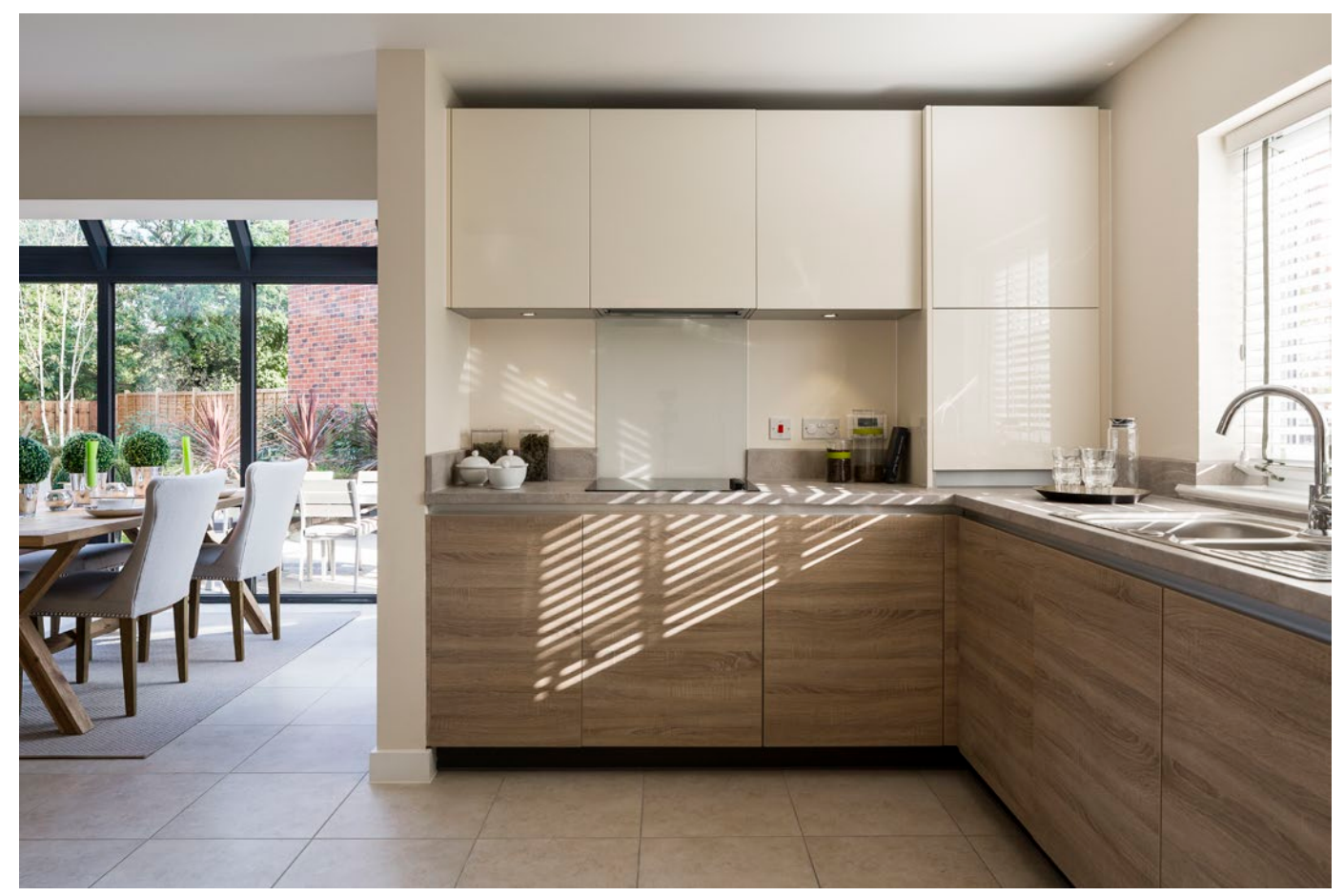
Horsted Park Inside, generous living spaces are filled with daylight and sunlight.

Homes are 'smart', low-carbon and energy efficient. Following the principles of passive design, walls, roofs and windows are well-insulated and airtight, and constructed using materials which keep rooms warm in winter and cool in summer. Solar gain and natural ventilation are used as much as possible for heating and cooling. This helps to keep running costs low for home owners and tenants and avoids fuel poverty. Products and materials are responsibly sourced and the 'embodied' carbon used in extraction, manufacture and transportation is kept to a minimum to ensure that the housing has a neutral or 'net positive' impact on the environment.