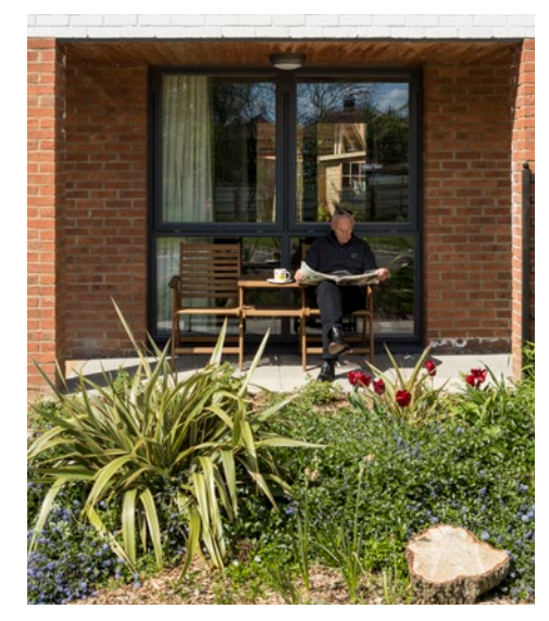
Derwenthorpe "The houses are designed to comply with the requirements of Lifetime Homes."

Homeowners or community groups who want to take greater responsibility for a building project in exchange for greater affordability – by cutting out the conventional developer – are beginning to come together to buy serviced plots to undertake their own self-build or community-led projects where essential infrastructure has been put in place.