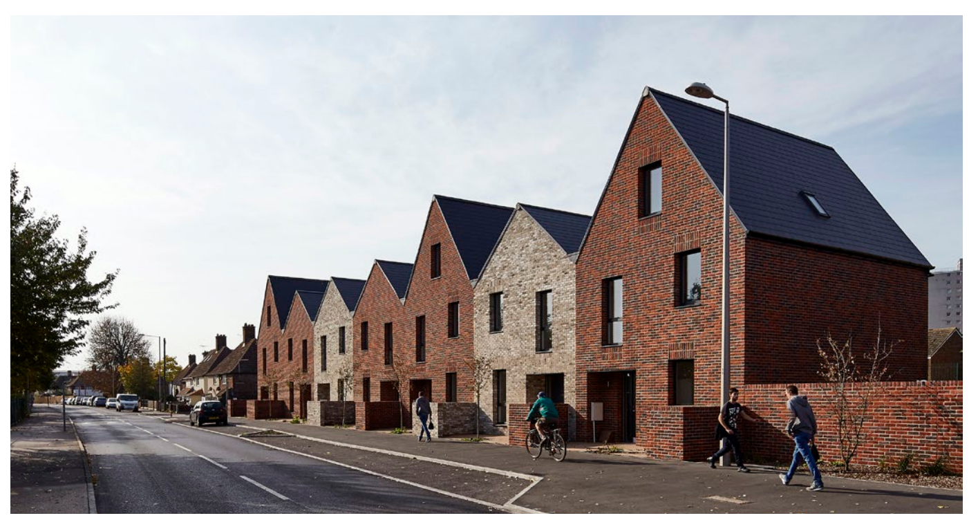
St Chads "All of the rooms are well-lit by huge windows, that are carefully laid out to frame long views and protect privacy."