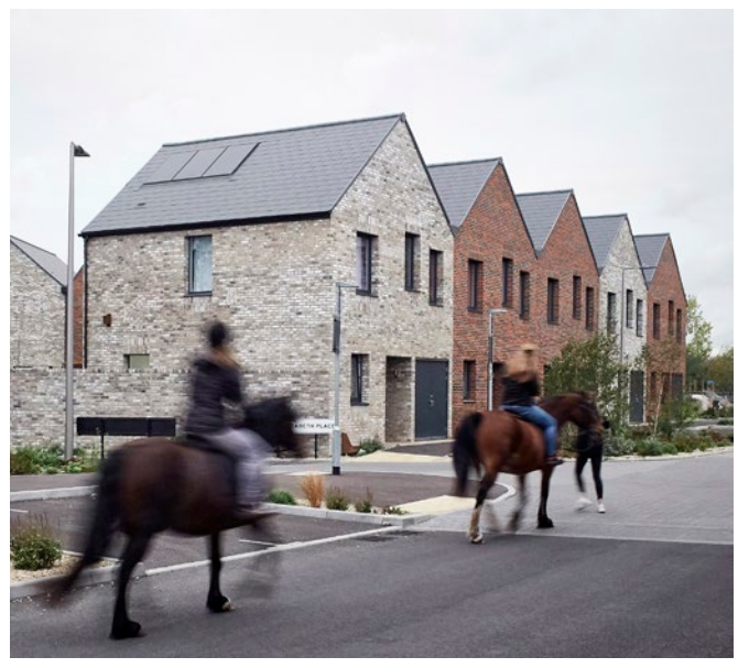
St Chads A linear park, arranged diagonally through the street layout, connects the new homes to surrounding farmland.