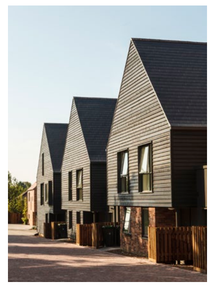
The Avenue "The palette of materials is traditional but the detailing is modern and crisp."

Durable and tactile materials such as brick and masonry – which go on looking good for many decades and even improve with age as finishes weather and mature – give the homes a discernible and timeless quality and enhance character. This character, coherence and material quality extends to the streets and spaces, creating an attractive and valued setting for homes. Well-chosen materials are also easier and less costly to manage and maintain in the long term.