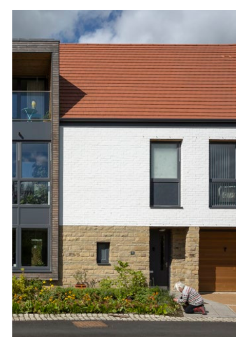
Derwenthorpe Affordable homes are 'pepper potted' across the whole, avoiding grouping of tenure and promoting equality and diversity.