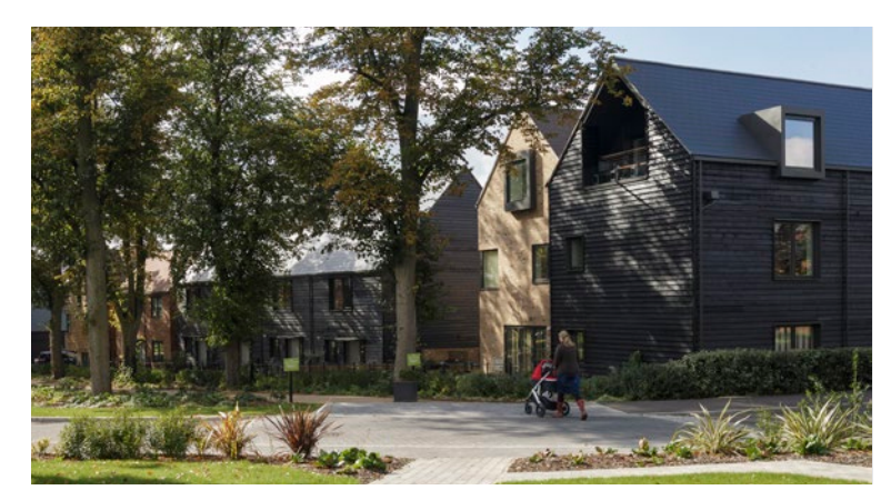
The Avenue "Retaining as many trees as possible has created a striking avenue of limes which form a now well used public route."