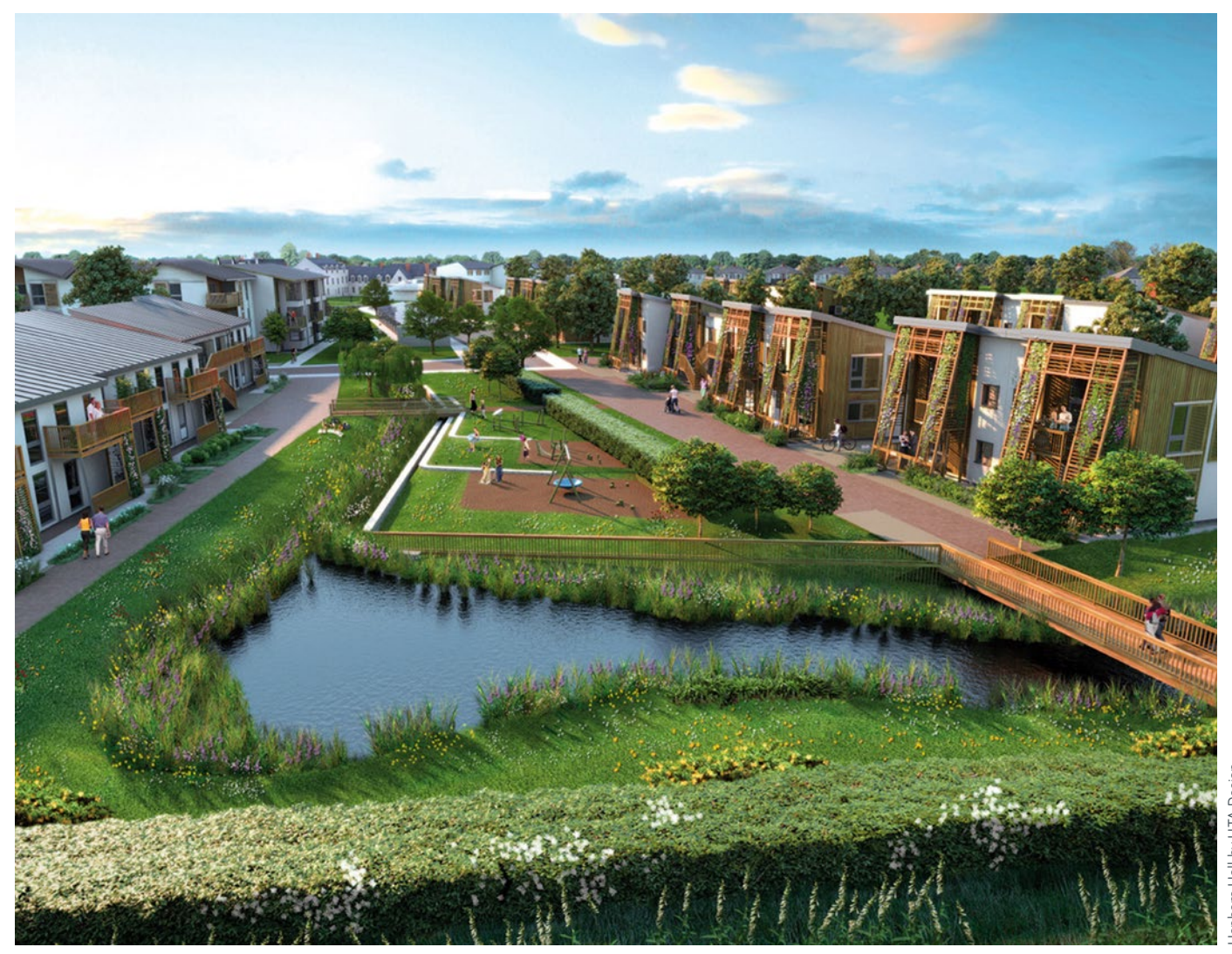
The homes at Hanham Hall are built from energy efficient factory made elements which minimise waste. Prototype units were constructed by Barratt Homes and tested for sound, airtightness and co-heating by Oxford Brooks University. Detailed energy monitoring of 11 house types and simplified energy monitoring of all homes was carried out. Annual resident feedback was captured by CIRIA over three years.