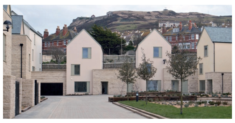
Officers Field The site makes the most of the challenging topography and maximises views towards Chesil Beach and the National Sailing Centre in Portland.

The varied scale and composition of the buildings and spaces responds to the existing form and visual characteristics of the area which people value. Rooted in local identity, the form and character of the neighbourhood – its homes, gardens, streets, and parks – build on the layers of local history and the essential spirit of the place.