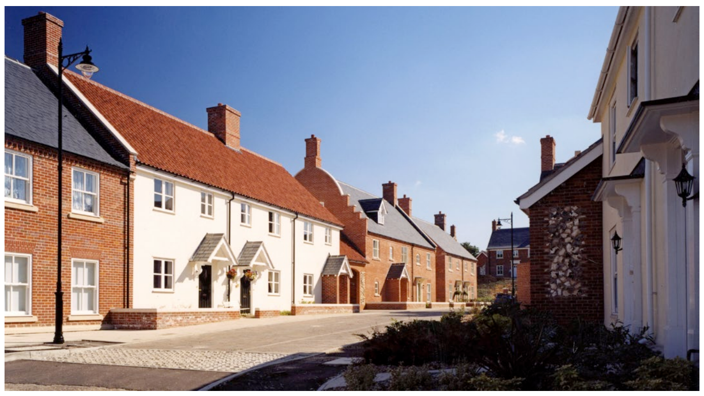
Trowse Newton The focus of the scheme is a crescent of houses at the end of the village street, incorporating the existing public house.