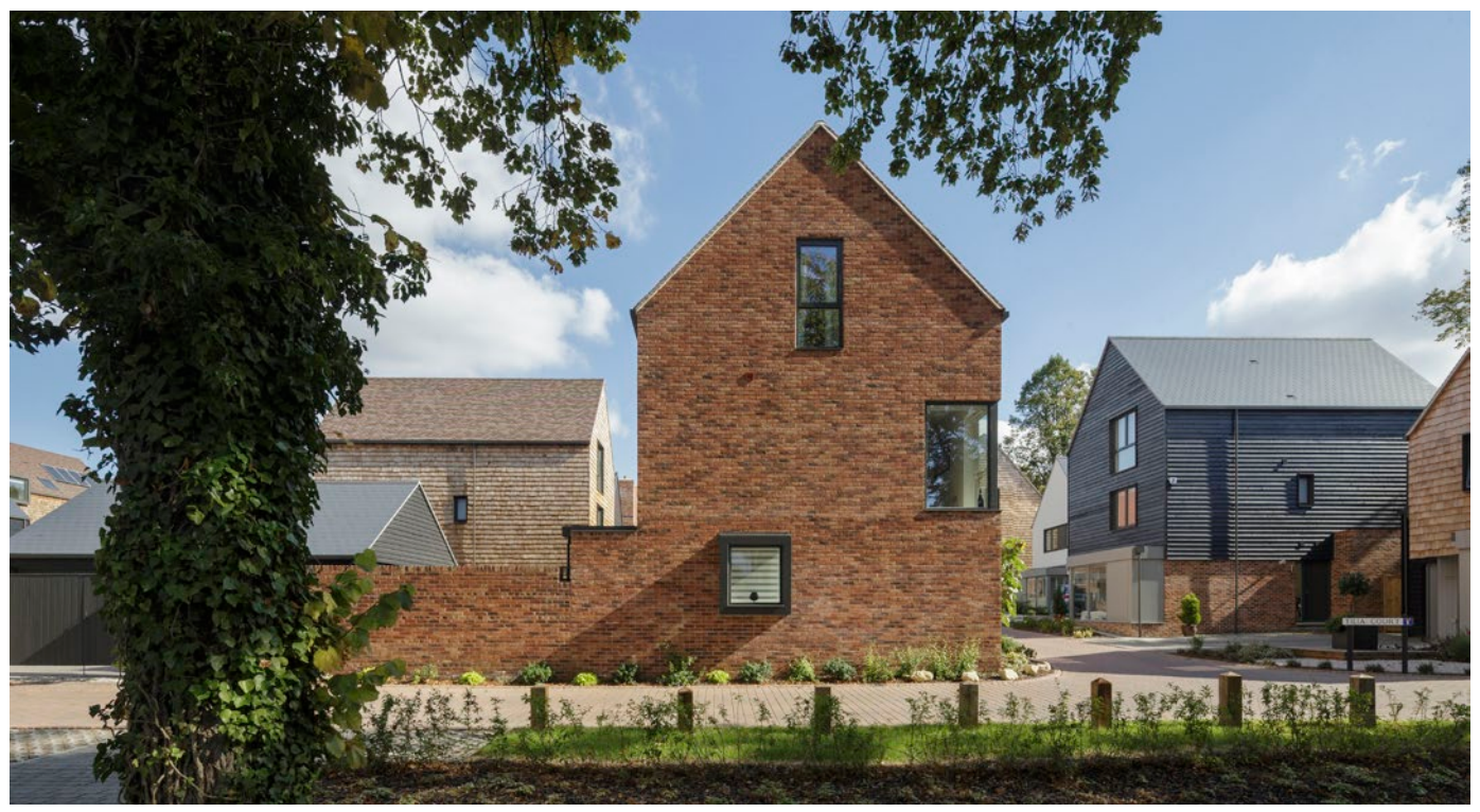
The Avenue "The lack of a pattern book allowed the architects to develop their own kit of parts, creating individuality and variety."