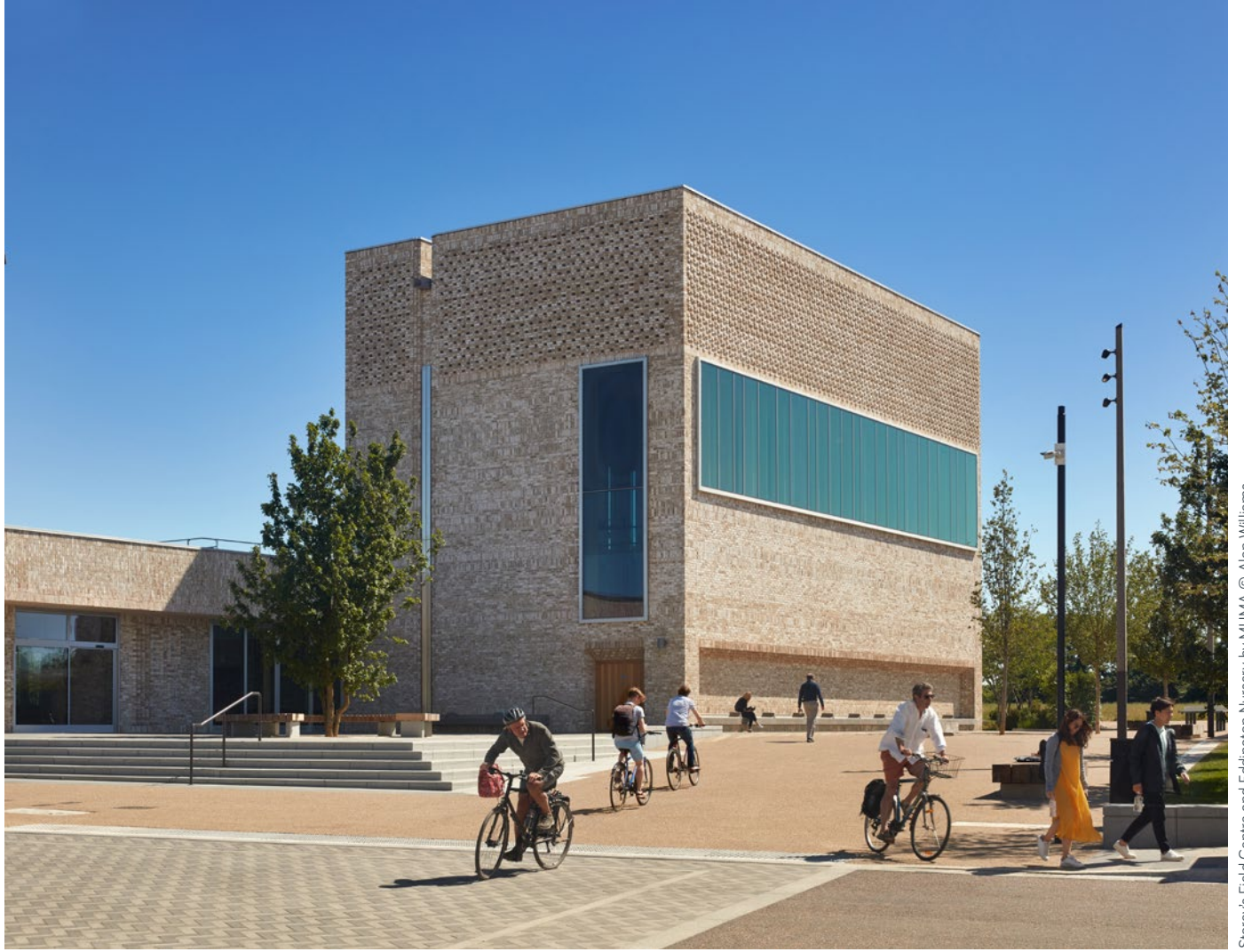
The first phase of the Eddington development will see the delivery of housing and community facilities including the RIBA Stirling Prize shortlisted Storey's Field Centre and Eddington Nursery by MUMA.