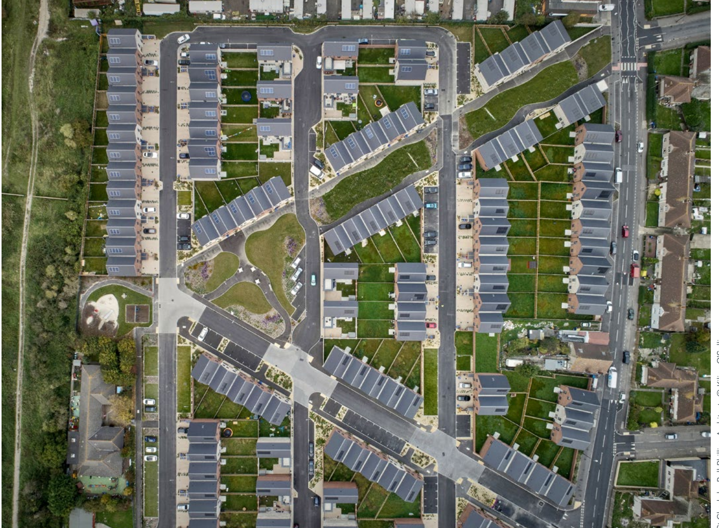
Gloriana, the company set up by Thurrock Council to kickstart housebuilding to meet local needs without undercutting the market, is funded by a mix of equity and debt. The company was sold council land at a commercially valued rate. Gloriana borrowed against council tax income, repaid loan interest through rental income and repaid debt when homes at St Chads were sold.