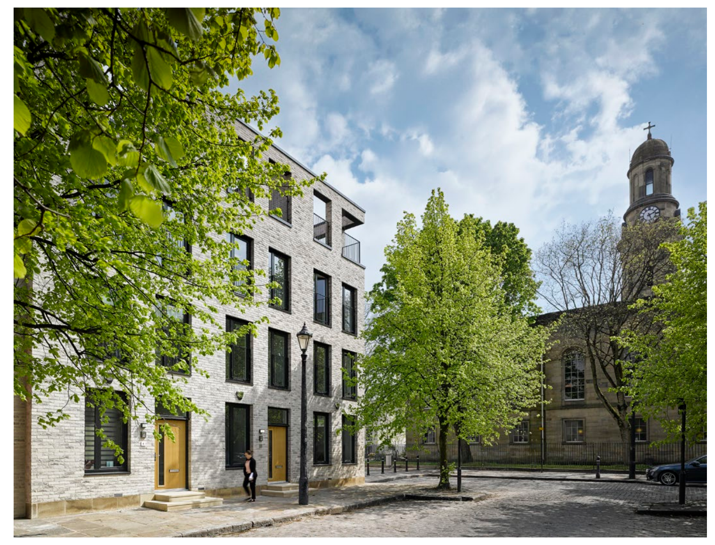
Timekeepers Square "The landscaping is well designed and executed, with fine natural materials and good detailing."