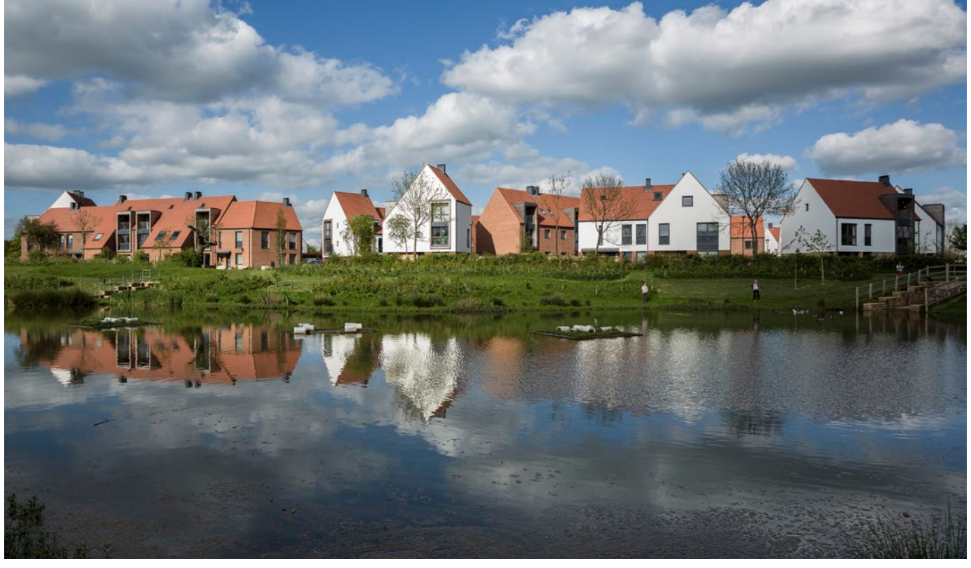
Derwenthorpe Existing hedgerows have been enhanced to structure the site and create ecological zones and amenity spaces threading through the development.