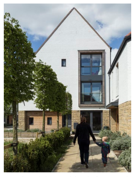
Derwenthorpe The houses are light and well-proportioned with generous flexible rooms.

Self-finished or self-built customised and personalised homes draw more deeply on what home means to an individual occupant, and add to the controlled variety of the streetscape.