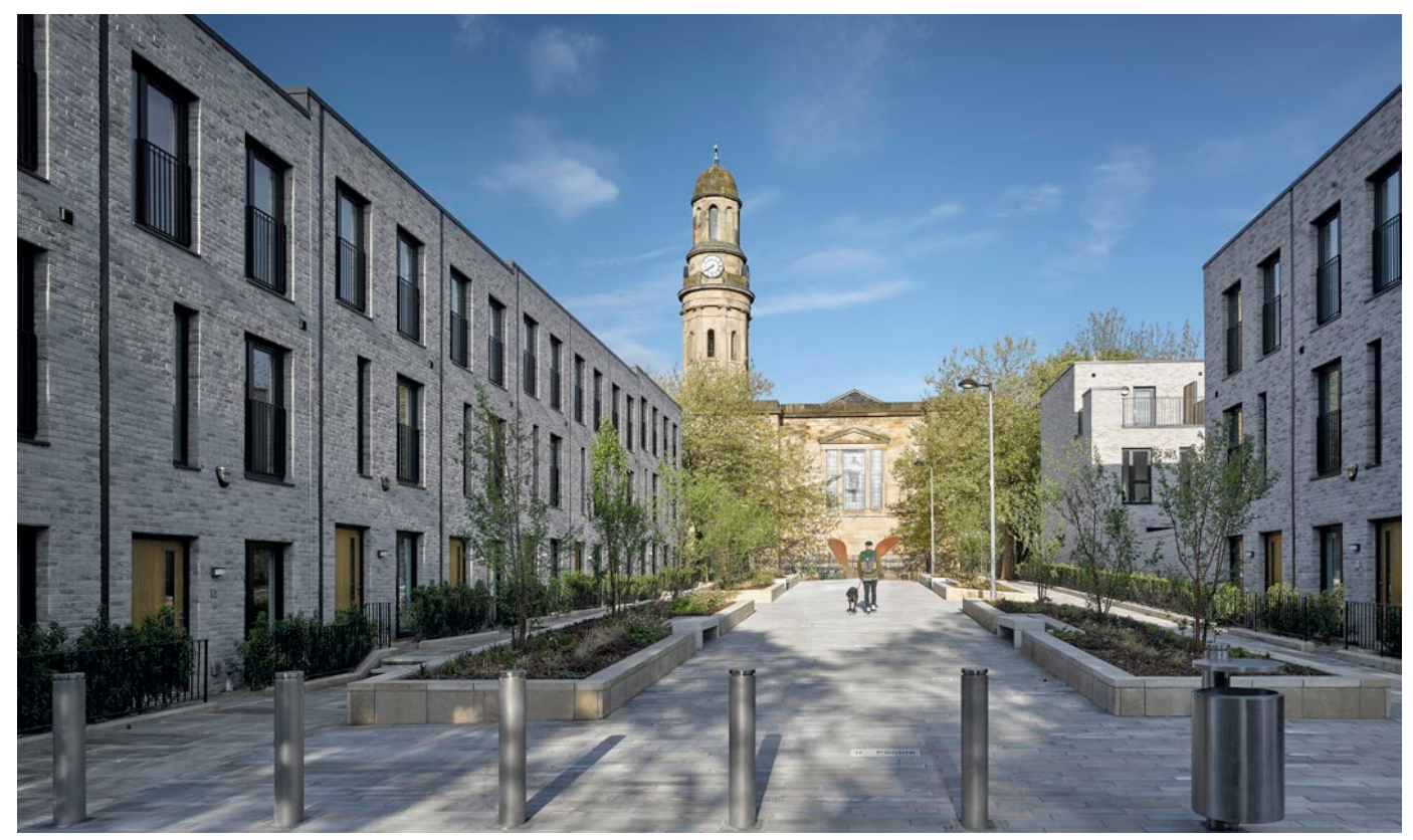
Timekeepers Square "The light grey brickwork acts as a gentle foil to the listed sandstone churches, creating a harmonious composition and a light cheerful atmosphere."