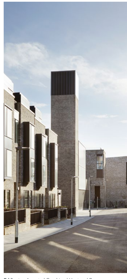
Eddington A central Combined Heat and Power energy centre serves the entire development.

Local bus links to surrounding places, shared transport schemes and car clubs provide a viable alternative to car ownership. Innovative parking strategies, adaptable to future reduction in car-use, are in place. Where people do currently rely on cars, they are integrated visually into the streetscape.