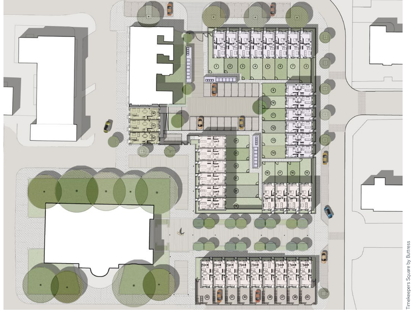
Timekeepers Square was delivered by the English Cities Fund, a joint venture between Muse Developments, Legal & General and Homes England, as part of the wider Salford Central Masterplan, the city's largest ever planning application. This 20-year regeneration initiative has the capacity to provide 849 new homes and 11,000 new jobs.