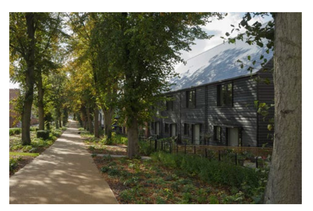
The Avenue "The trees and landscape that were planted in 1879 have subsequently matured into a fabulous setting."

Enclosed shared spaces or private gardens which optimise solar orientation can be enjoyed as an extension of the internal environment and encourage year-round outdoor living at every life stage; active gardens for play and hobbies, and productive gardens for growing.