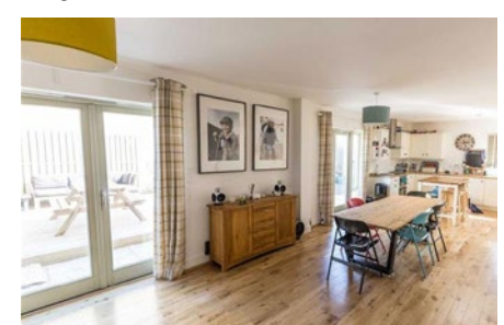
Officers Field "Houses exploit all sides to gain light and views, and reveal themselves as light-filled."