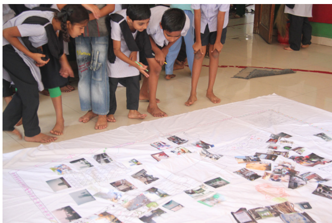
Muktangan Lovegrove students making their map of Mariamma Nagar settlement, Mumbai 2014