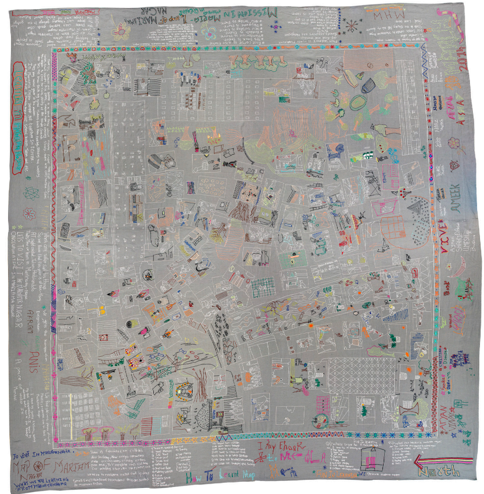
Map of neighbourhood Mariamma Nagar in Mumbai, India by Lovegrove 6th standard. Using photographs drawings and annotation, the students made a map of how they felt they learnt in their neighbourhood. Images from a learning architecture, a project by Nicola Antaki, 2014.